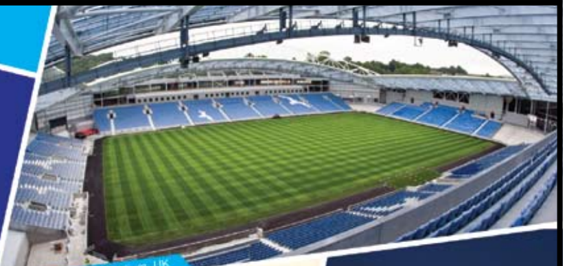
AMEX Community Stadium, UK

“ Every young footballer wants to play at Wembley. For me, it's the ultimate stadium. ” David Beckham