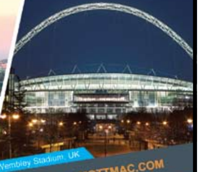
Wembley Stadium, UK