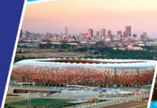
Soccer City/FNB Stadium, South Africa